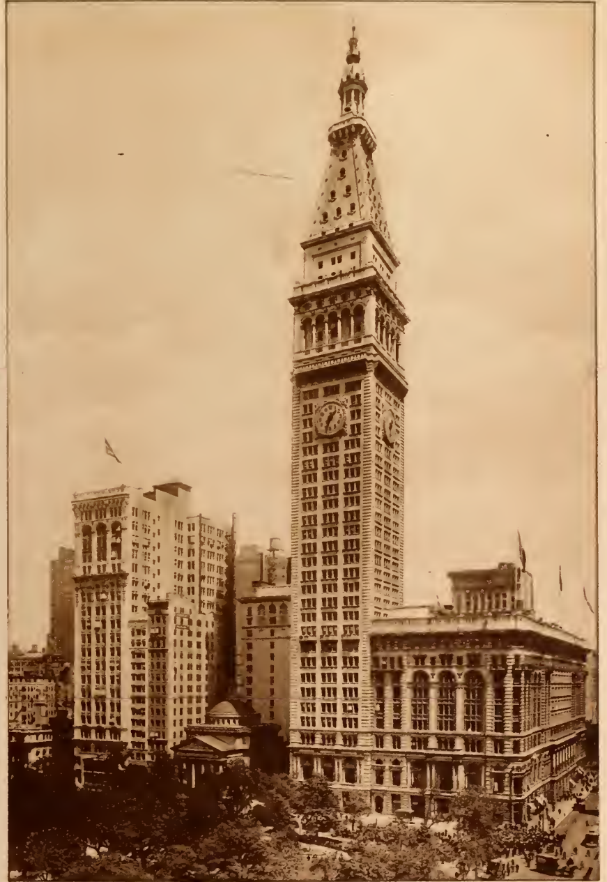
METROPOLITAN TOWER, at 1 Madison Avenue. Occupies entire block to Fourth Avenue, between 23rd and 24th Streets. Tower 52 stories, 700 feet high.